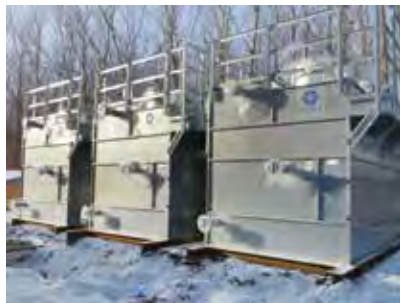
◆ Stage II