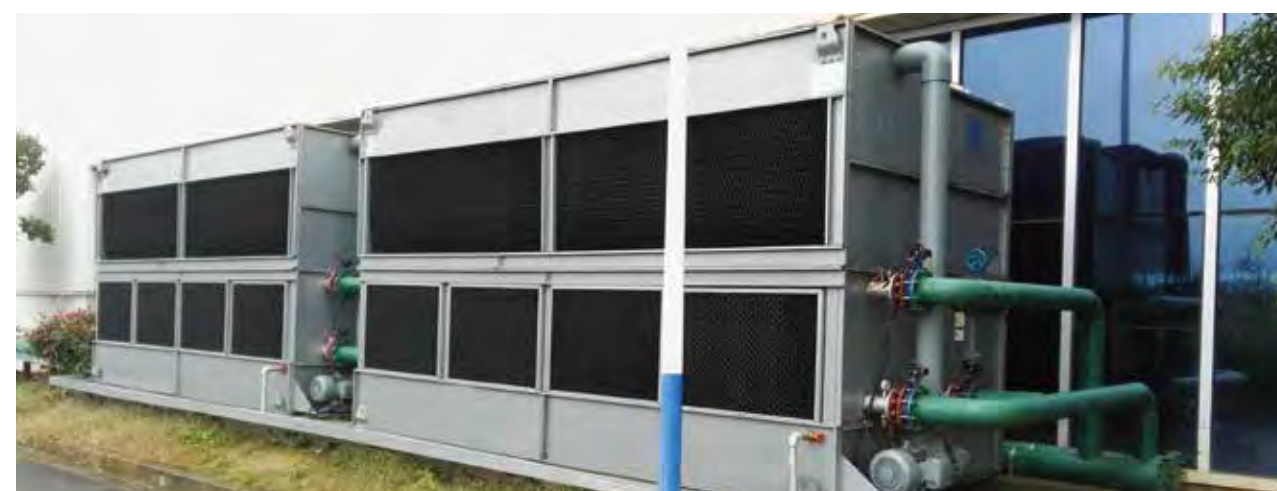
◆ Tsinghua Tonfang