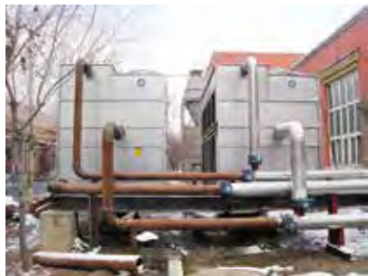
◆ Stage I