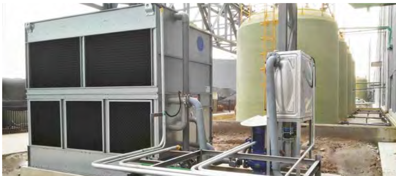
◆ DONGFENG-NISSAN /Massive Quenching Oil