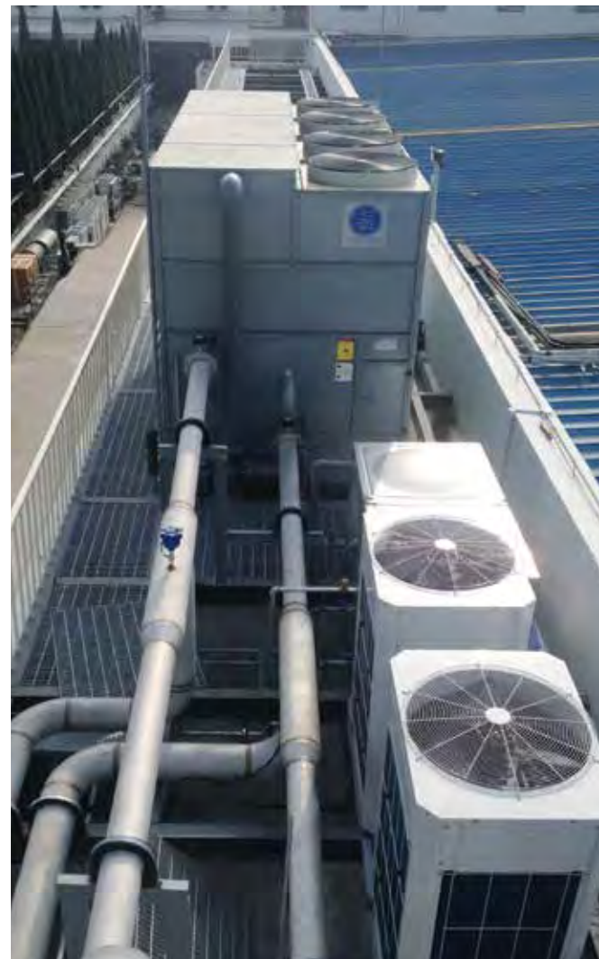
◆ For YORK A/C