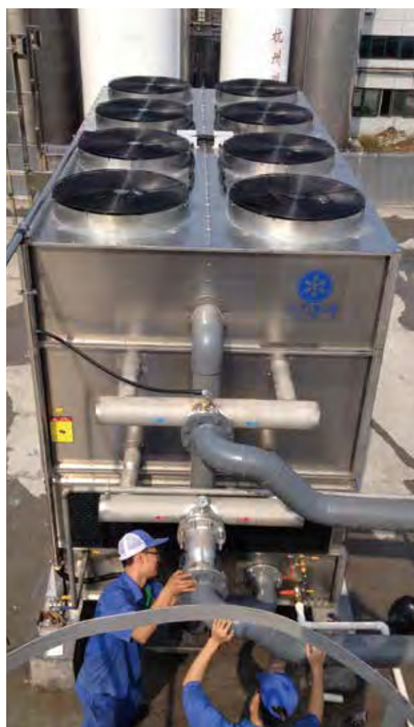
◆ For Tsingtao Brewaery