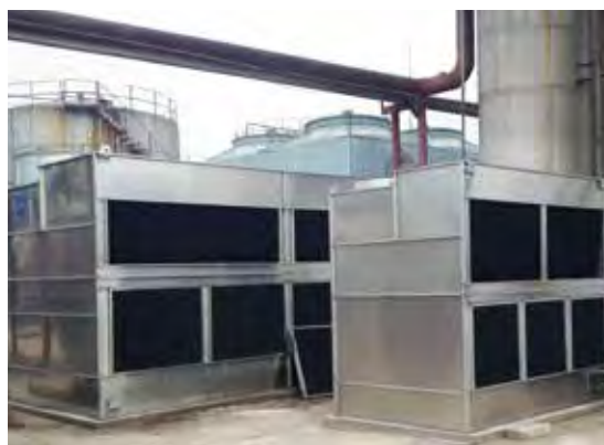
◆ Hangzhou Sannai Enviroment/ Transformer Oil