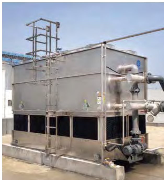
◆ For Tsingtao Brewaery

Data Centers, Frequency Converters, Injection Machines, Printing Lines, Drawbenches, Polycrystalline Furnaces, etc.