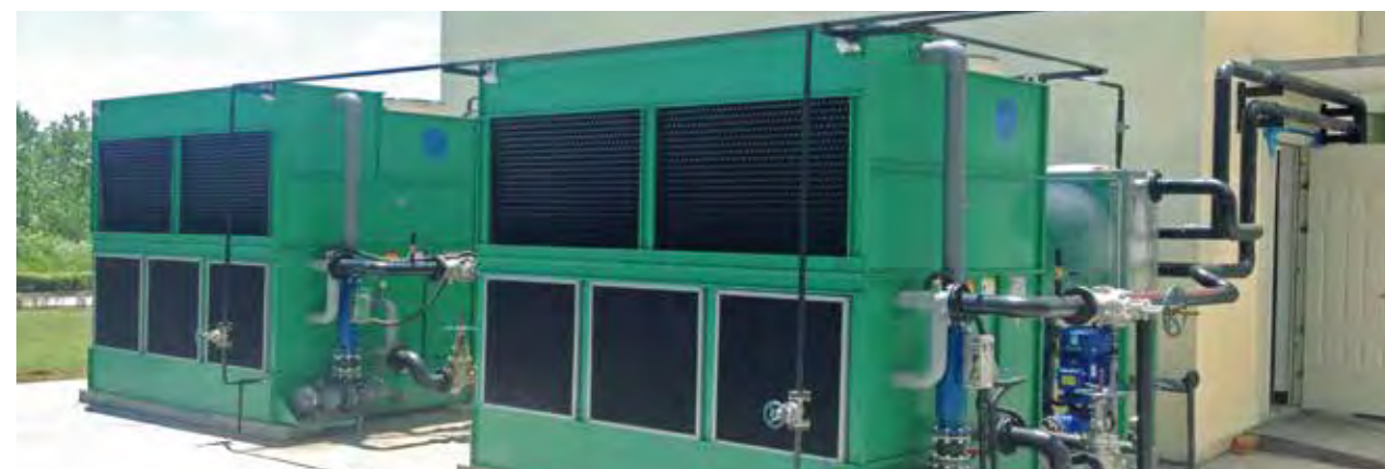
◆ For Zhiguang Electric