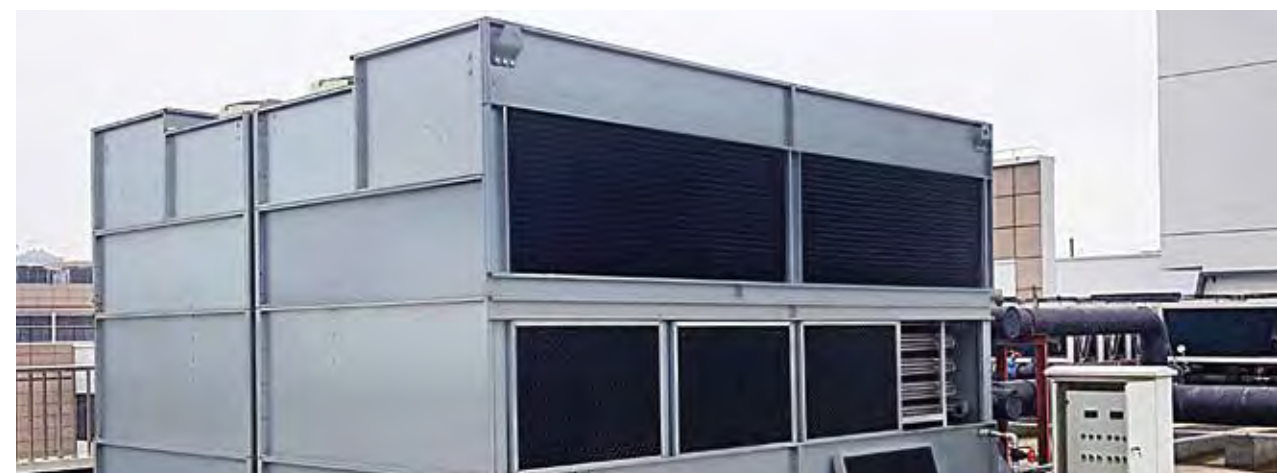
◆ Xuyi Hospital