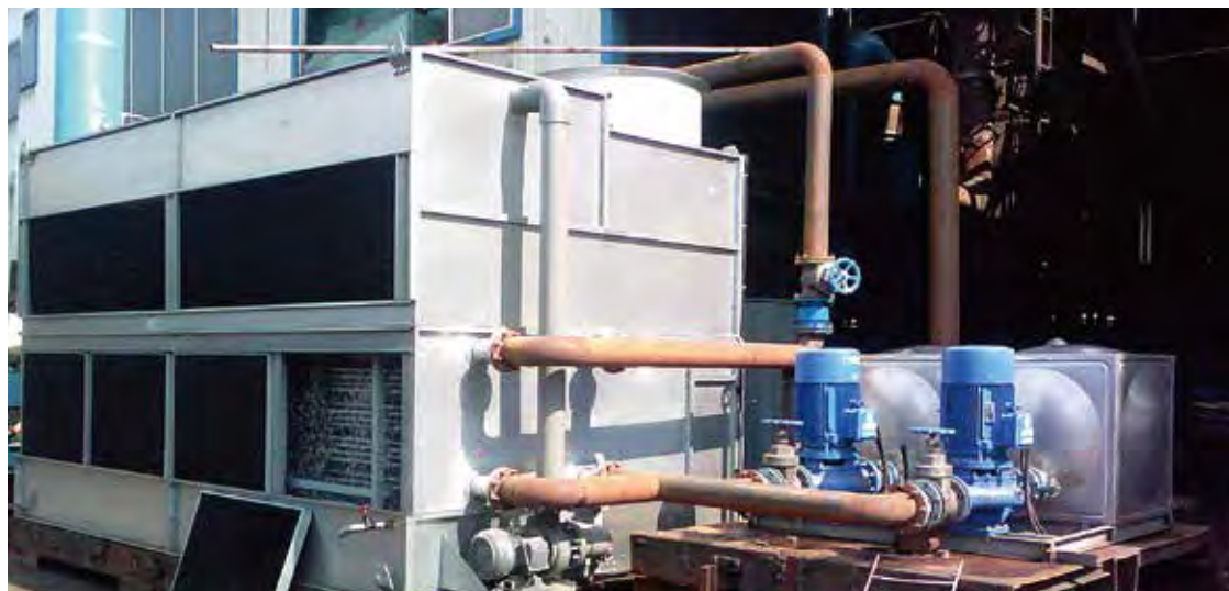
◆ For New United Group