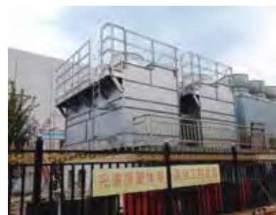
◆ Stage III