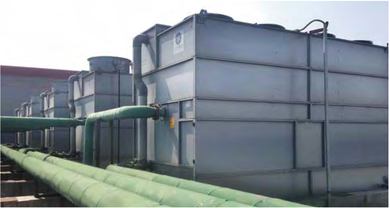
◆ For SiDa MF. Induction Furnace