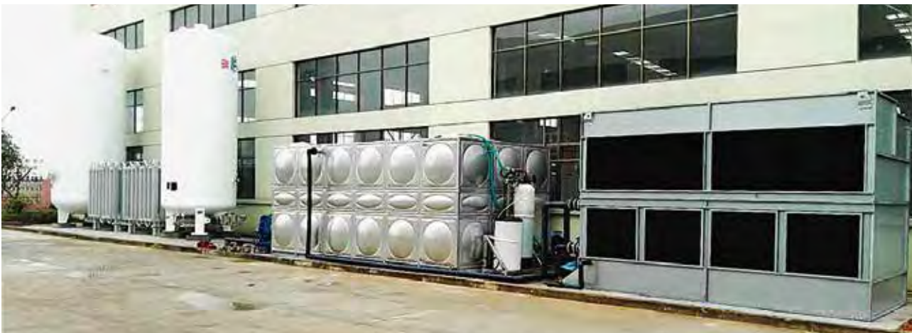
◆ For Jinfei Holding Group