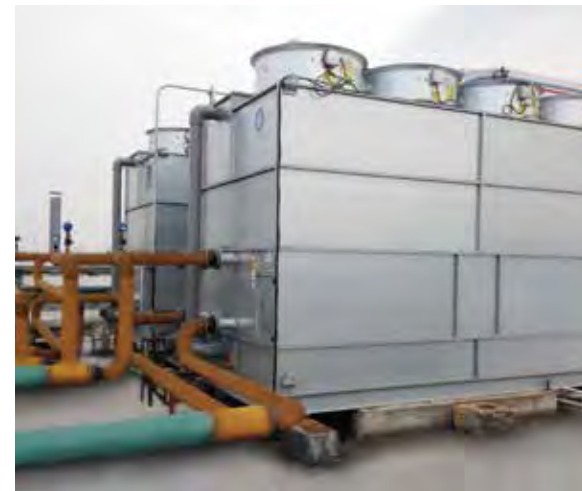
◆ For Trane A/C