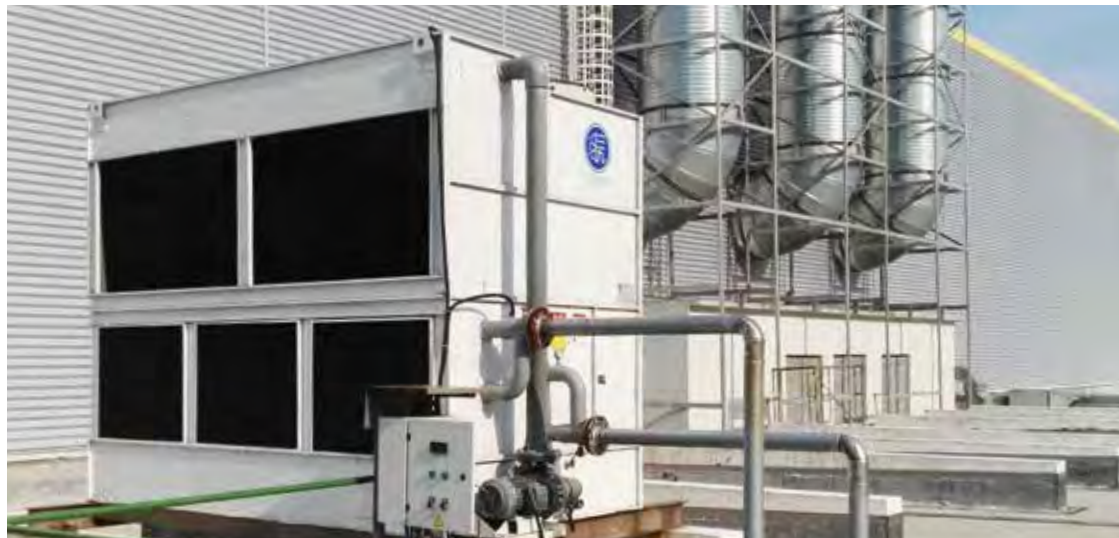
◆ For Xinjiang Baomo Petrochemical