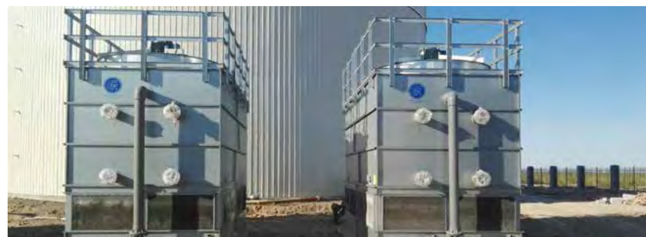
◆ For Xinjiang Baomo Petrochemical