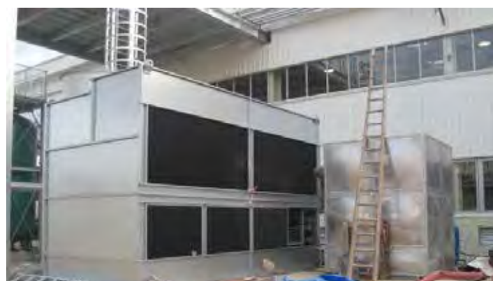
◆ Pusheng Chemical/ Formaldehyde