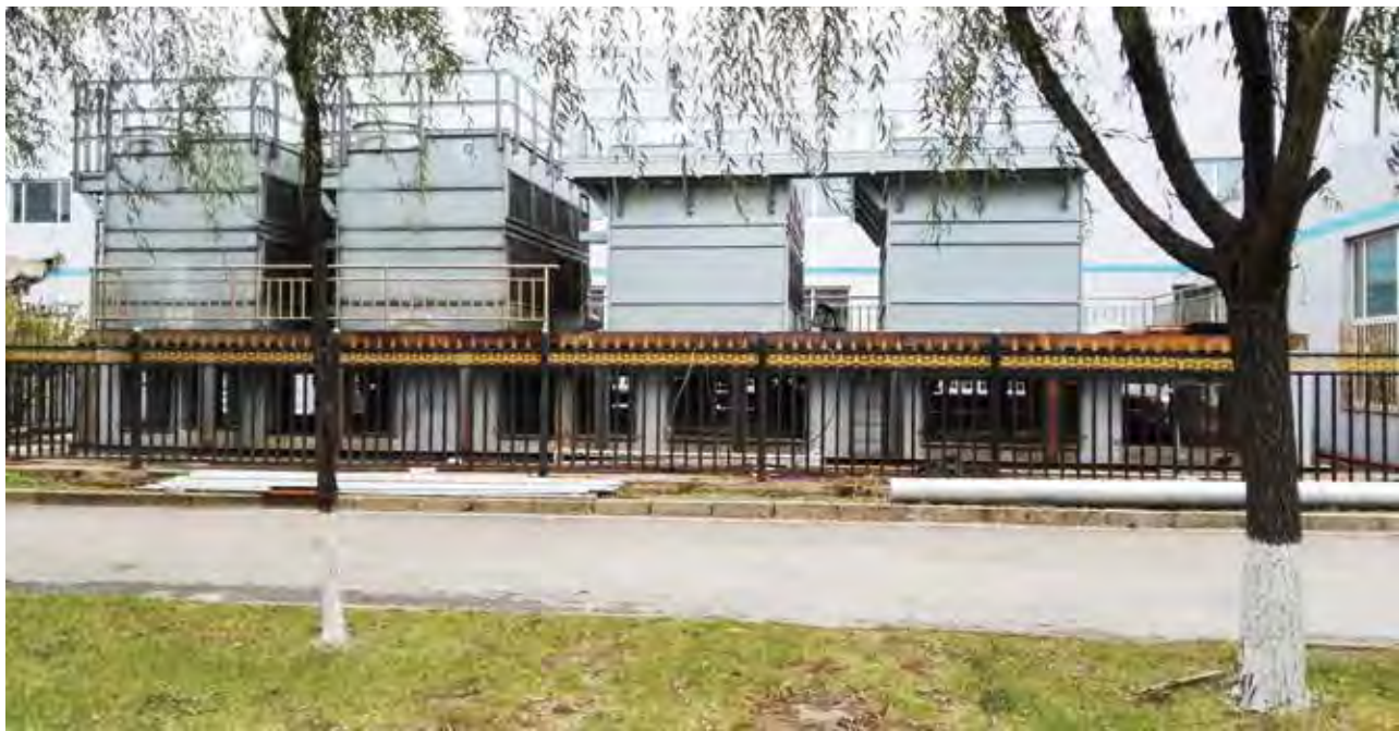
◆ Stage IV